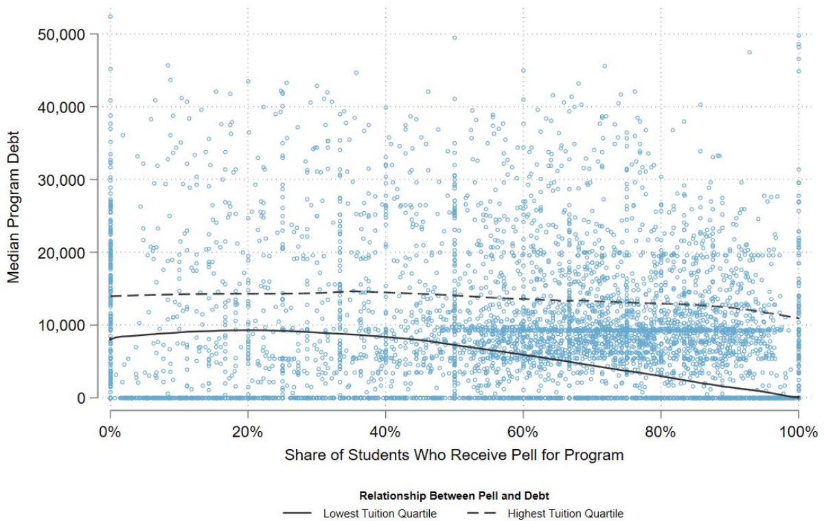
Figure 2: Program Debt Levels and the Share of Students Receiving a Pell Grant Among Undergraduate GE Programs

The Department has taken care to design the rule in a way that is fair and not counterproductive to the crucial work being done by institutions that provide access to valuable career training programs for underserved students. As Figure 2 shows (for all undergraduate GE programs) median debt levels across programs bear almost no relationship to the share of a program’s students who receive a Pell Grant (i.e., the fit lines, showing the average debt levels for programs in high- and low-tuition institutions, in the figure are flat). Measures of program debt do not therefore reflect income differences of students across programs. but rather differences in costs. The Figure makes it clear that differences in tuition have a large impact on student debt levels: institutions in the top 25% in terms of their tuition levels have programs that leave students with about $5,000 more in debt than institutions in the bottom 25% of tuition levels—a difference that is about the same regardless of the share of Pell students at the program. 3