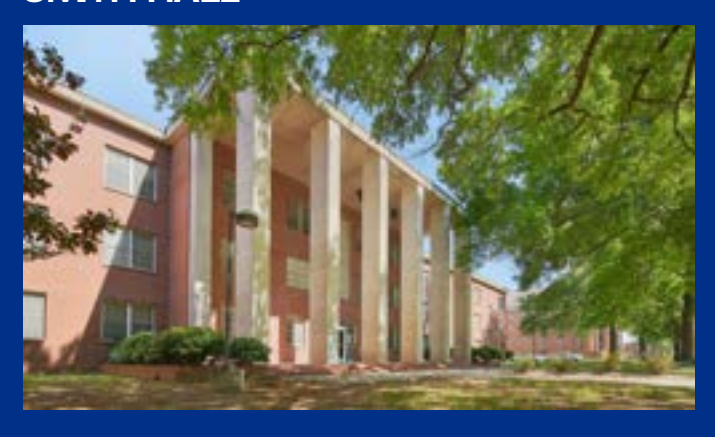
LIVING LEARNING COMPLEX (LLC)