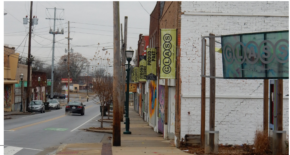
Glass House Collective, Chattanooga, TN

Here are some reflections from the students who participated in the Tennessee Planning Tour: