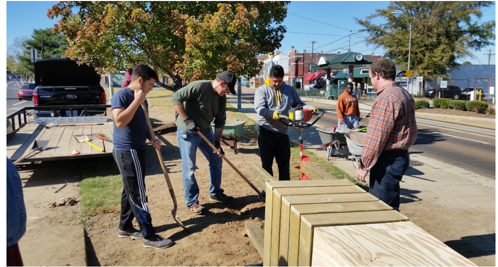
Edge Triangle design build - sign installation

You can read more about the UMDC's community partnerships and research outcomes at http://www.memphis.edu/umdc .