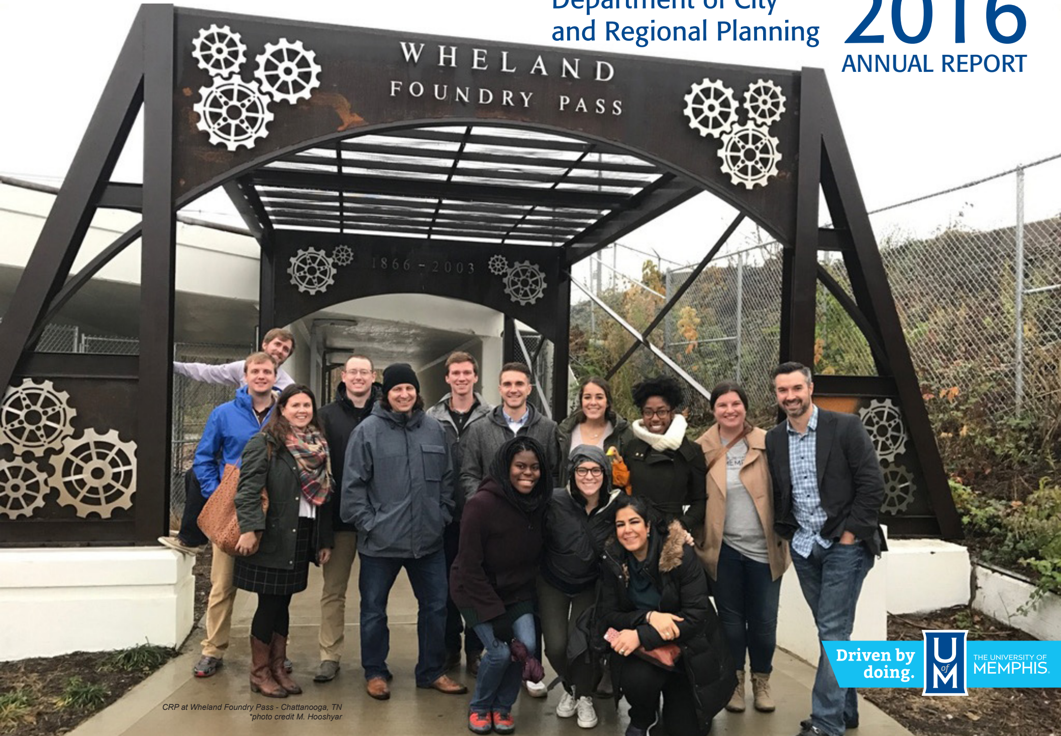
CRP at Wheland Foundry Pass - Chattanooga, TN