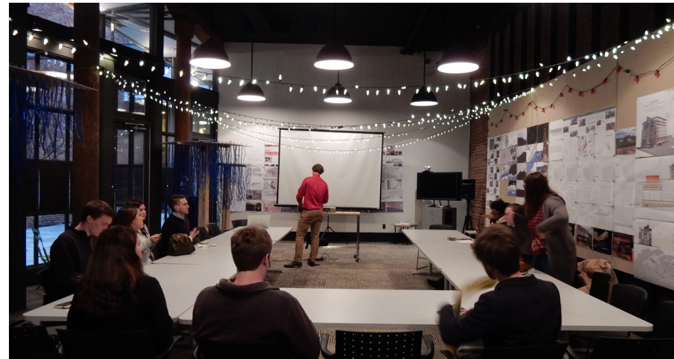
Nashville Civic Design Center