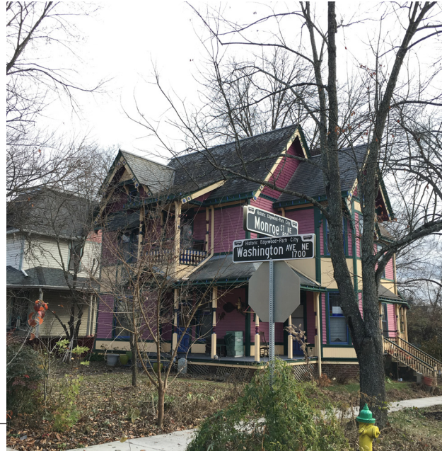
Victorian home in Edge Park Historic District, Knoxville