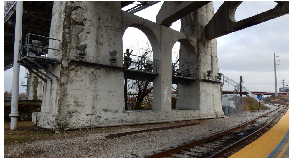
Cumberland River Greenway, Nashville, TN