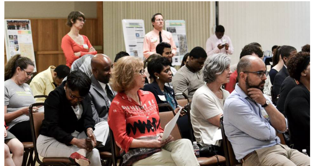
Spring 2016 Healthy Places Summit