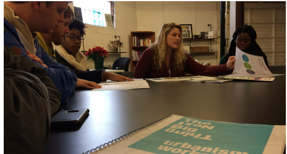
Reviewing planning documents at Glass House