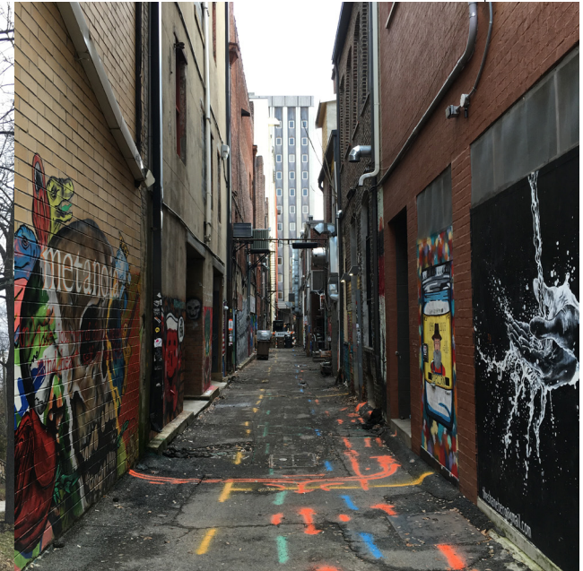
Strong Alley (near 400 block of Gay St.), Knoxville