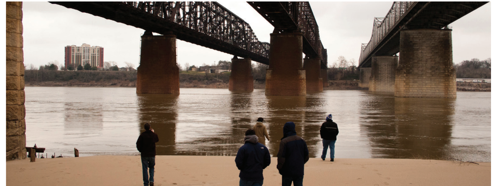
Studio site visit to West Memphis, Arkansas