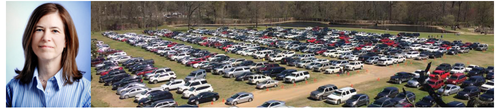
Memphis Zoo overflow parking on historic Greensward of Overton Park, Memphis