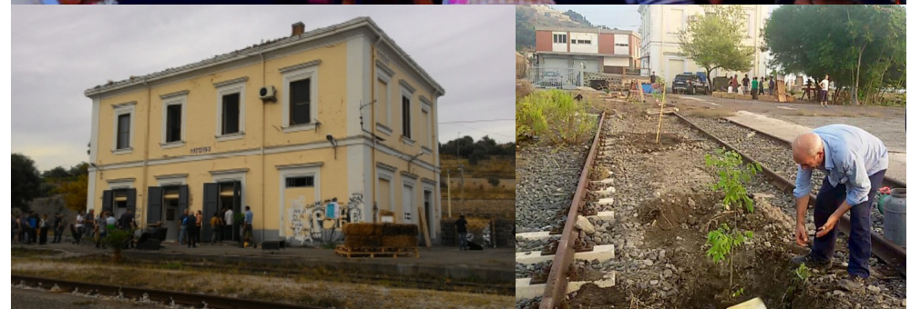
Transformation of the San Marco station