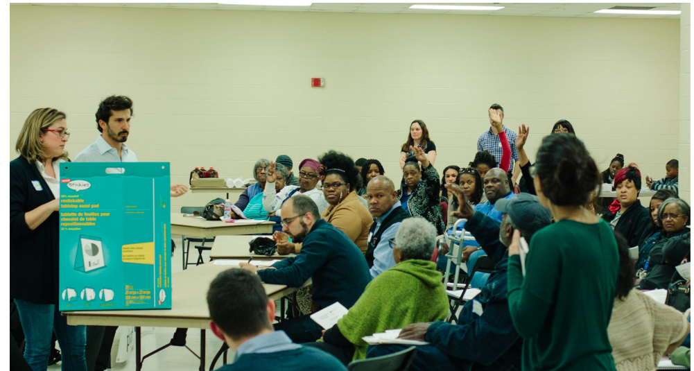
Faculty facilitate a visioning exercise in Klondike - Smokey City

The continuation of this community partnership will see the development of an economic development plan. The collaborative efforts will also focus on identifying funding opportunities to implement the addition of neighborhood amenities such as parks and improved housing, and strengthen existing amenities such as community gardens. A renewed focus on urban gardens could see the development of concepts such as an indoor farm and a cooking school. These neighborhoods, and our partnership, were recently highlighted in High Ground News .