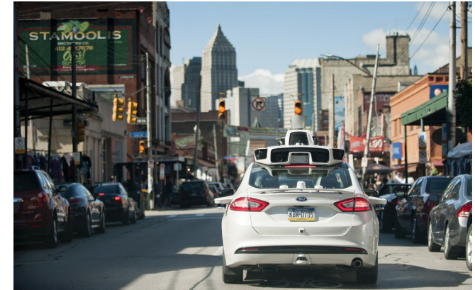
Autonomous vehicle testing in Pittsburgh, PA