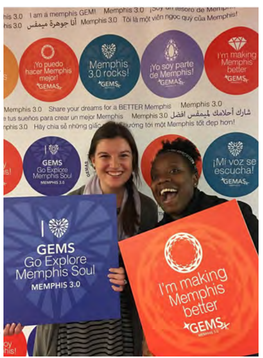
CRP students participate in Memphis 3.0

As the Department's research and outreach center, the UofM Design Collaborative is leading our efforts. In the fall of 2017 the UMDC was selected, along with a national firm and two other local consultant firms, to develop Memphis 3.0's district plans. These neighborhood-scale community character plans will build upon citywide vision and goal statements.