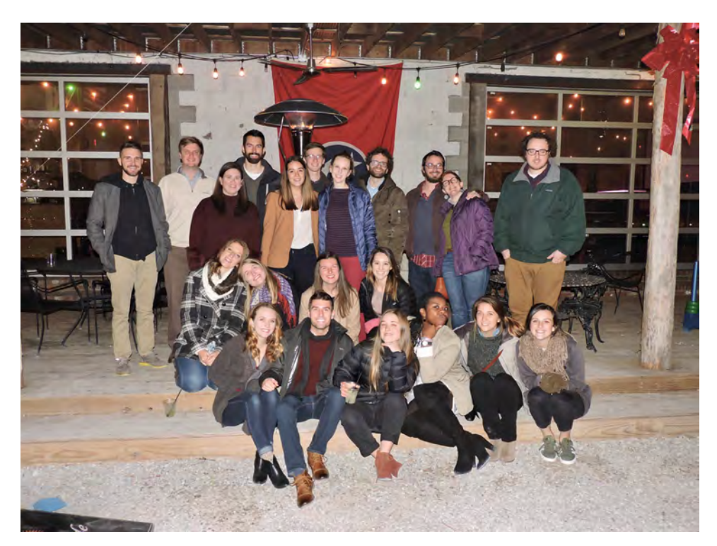
CRP students celebrate a successful semester

Our new undergraduate concentration had its first graduate, with a bachelor in professional studies, in 2017.