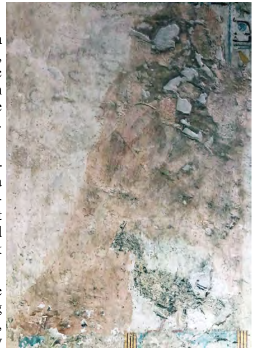
Abrasion of Rekhmire's figure (Theban tomb 100) and hacked Amarna erasure of goose

Through my investigation and analysis of these tomb defacements, I hope to reach a more nuanced understanding of the practice and implications of memory sanction in ancient Egypt and elucidate the historical value of deliberate damage as archaeological artifacts in the analysis of ancient Egyptian monuments.