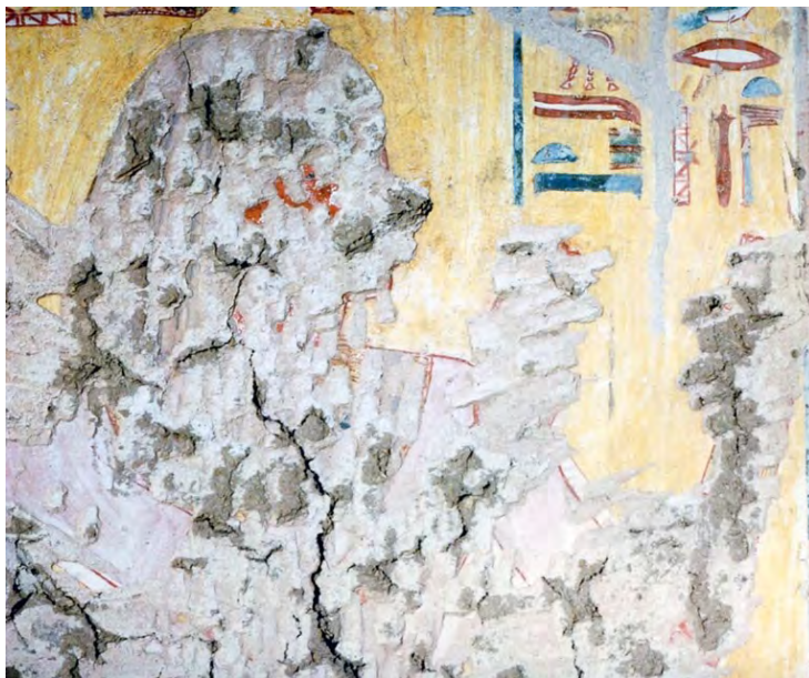
Clearly defined chisel marks on the figure of Tjenuna, owner of Theban tomb 76.