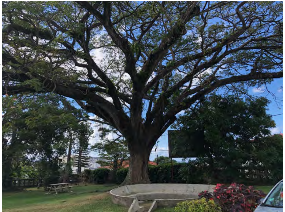
The zamana tree in the front yard of the Institut Martiniquais d'Etudes