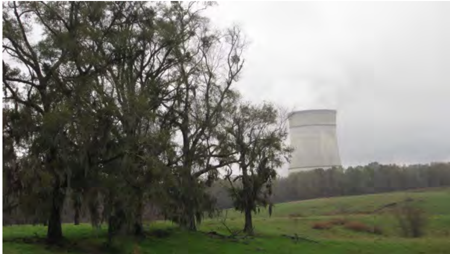
The cooling tower at Grand Gulf Nuclear Station's cooling tower in Port Gibson, MS