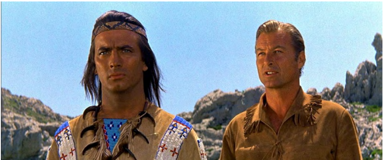
Pierre Brice as Minnetou and Lex Barker as Old Shatterhand