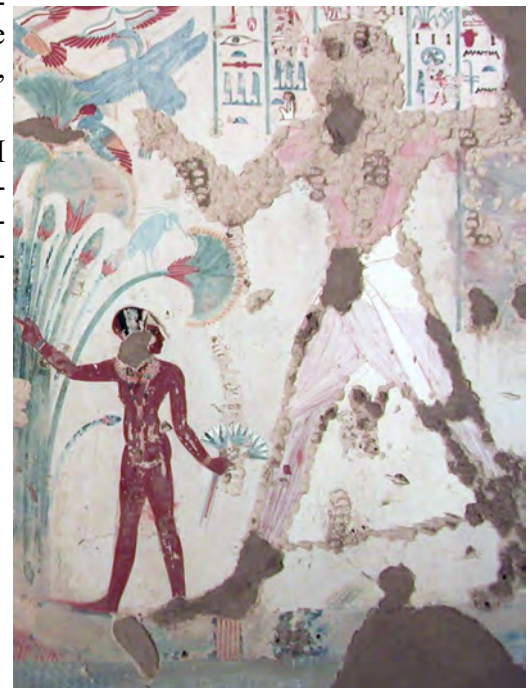
Defaced image of Horemheb (Theban tomb 78). Chisel marks also trace the edges of his garment.