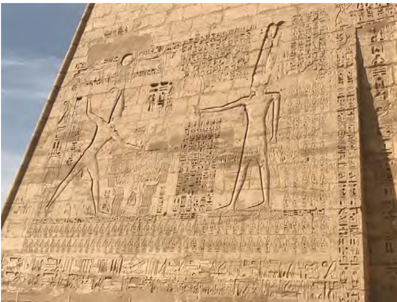
The First Pylon of Medinet Habu, the mortuary temple of Ramesses III.

My dissertation research focuses on New Kingdom Egyptian triumph scenes with topographical lists and the ideologies behind them. In particular, I am studying the discrete iconographic elements and textual elements present in these scenes, as well as their precursors in earlier Egyptian art, architecture, and texts. My goal is to trace the development of these elements over time to determine how and why they were used together to construct meaning within the larger triumph scene motif.