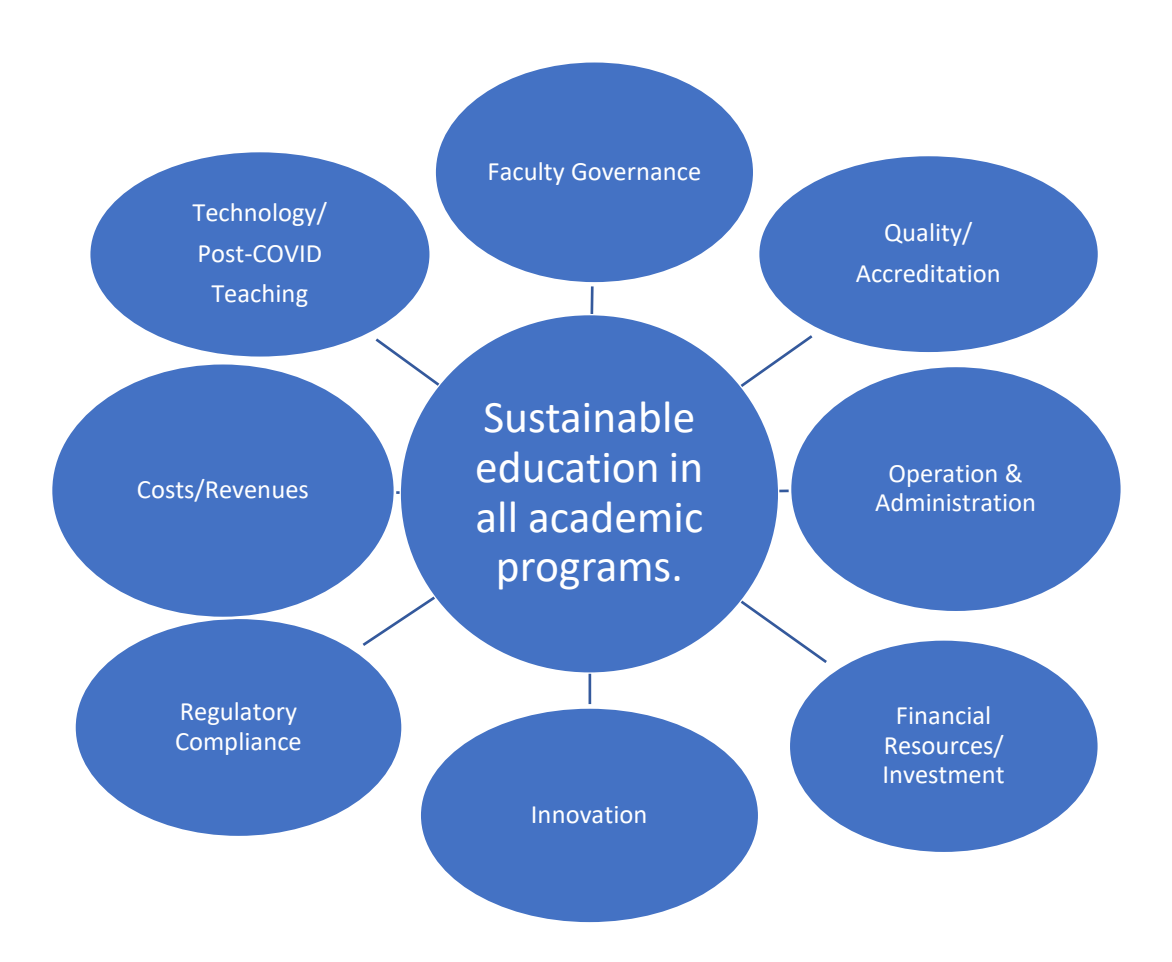
Figure I Education Sustainability Model