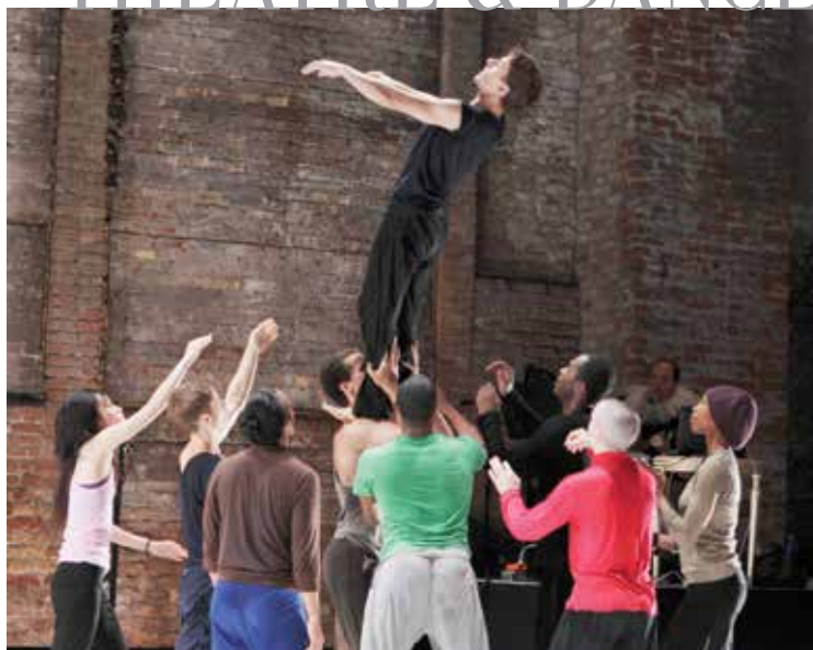
Bill T. Jones/Arnie Zane Dance Company is a world-renowned nine-member company recognized as one of the most innovative and powerful forces in the modern dance world. The company conducted a workshop on Nov. 2-3 in the DanceSpace in the Communication and Fine Arts Building at the University of Memphis.