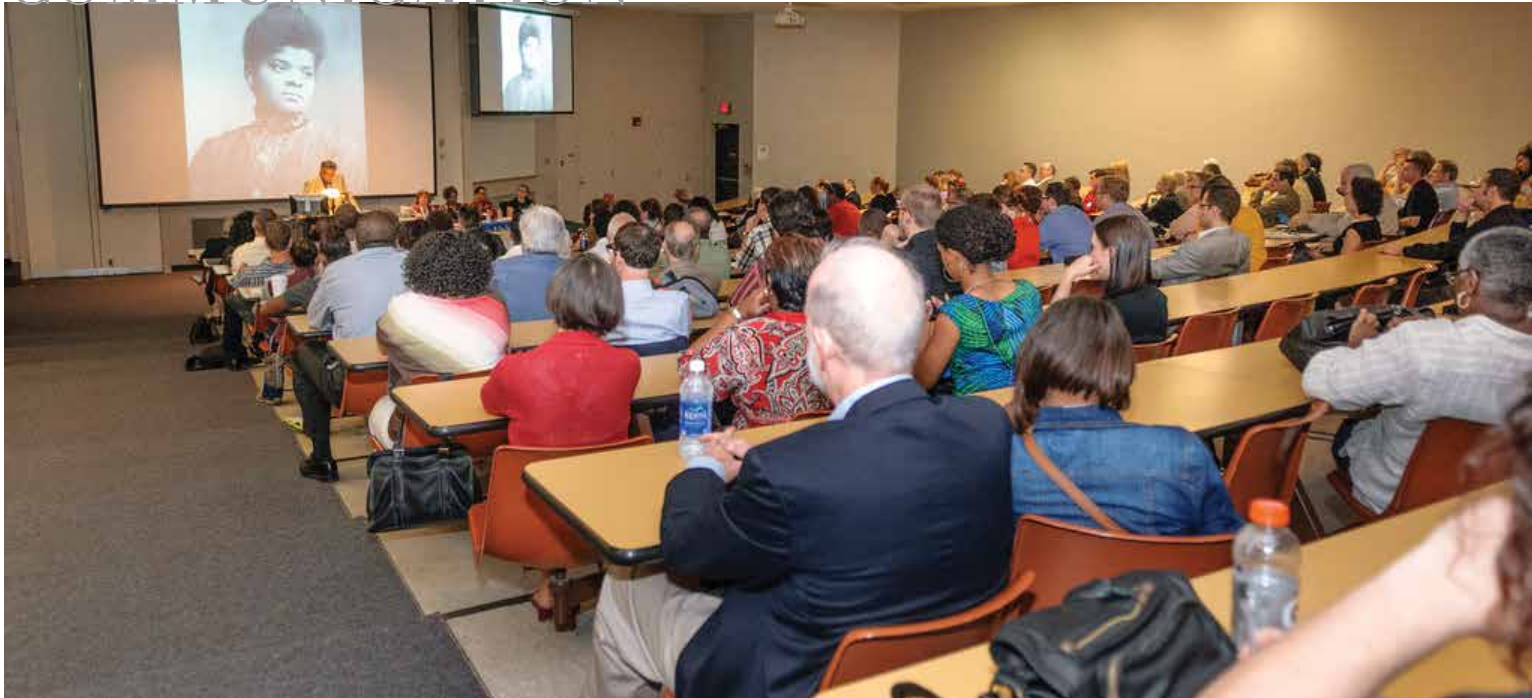
Several Douglass High School public service and communication-focused students attended the Ida B. Wells lecture in the Art and Communication Building auditorium at the University of Memphis.