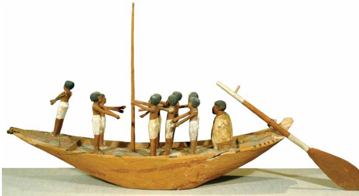
Model funerary boat Middle Kingdom ca. 2,000-2,200 B.C. from the collections of the Institute of Egyptian Art & Archaeology at the University of Memphis. Edward and Suzanne Trezevant Little Fund.