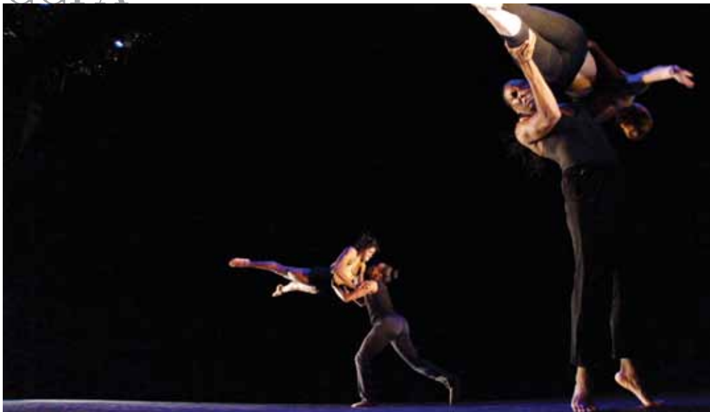
Dayton Contemporary Dance Company presented Highest Praise at the U of M's Michael D. Rose Theatre on November 10.