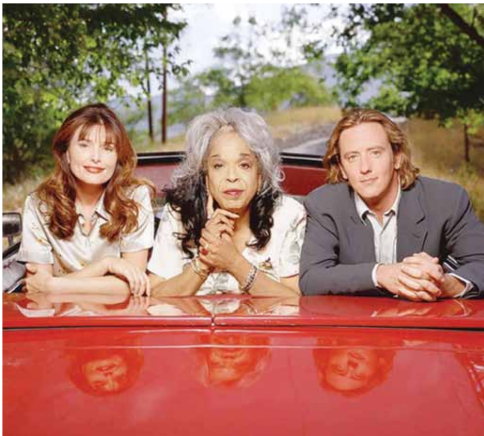
John Dye with Touched by an Angel co-stars Della Reese (middle) and Roma Downey (left).

While in Memphis, Dye played the role of Skip, in the Judd Nelson film Making the Grade (1984), which was filmed at Rhodes College. He left Memphis to pursue other film roles and, in 1986, starred alongside Virginia Madsen and Cynthia Gibb in the comedy Modern Girls . In 1987 he played the character of Todd Barrett in Campus Man , which was