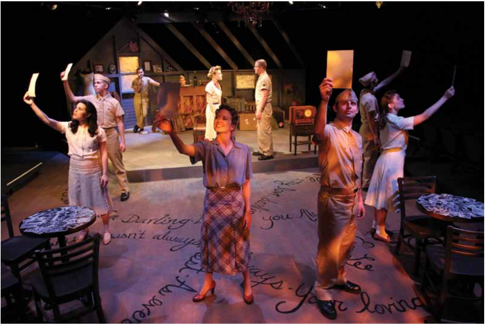
Above and right: Scenes from Love in a Time of War, performed at the University of Memphis in October.