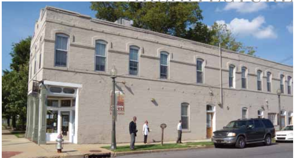
The Department of Architecture's Downtown Design Studio in Memphis' Uptown Neighborhood.

Students spent the first part of the fall semester preparing an urban design master plan for the Pinch and Uptown area including the identification of more than 20 potential development projects based on site context and market needs. The next phase was to develop an architectural design project that responded to one of the identified needs. Among the