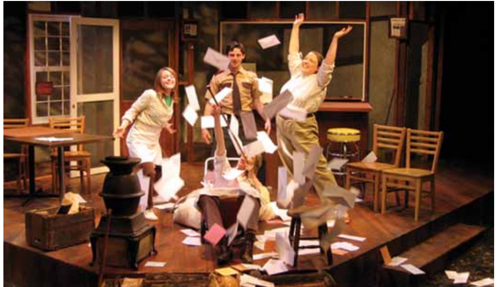
Top: The Mystery of Edwin Drood was part of the University’s 2007/08 theatre season. Above: The Spitfire Grill was part of the University’s 2008/09 theatre season.