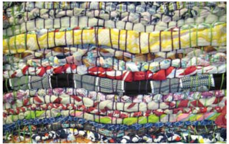
Work created by Community Art Academy students.