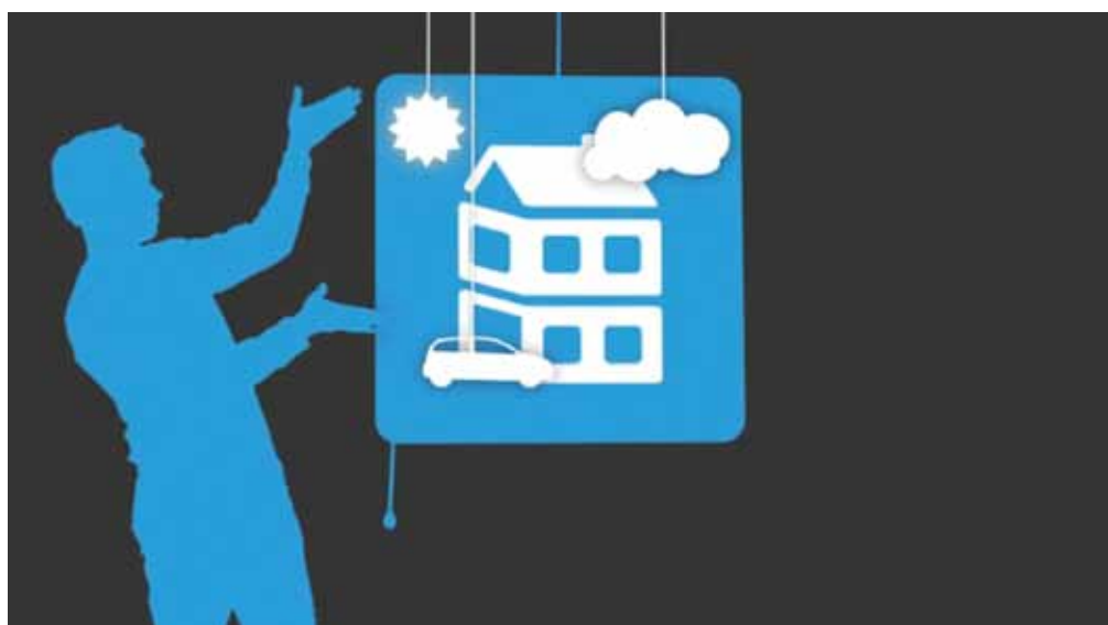
Screen shots from the SHELBY Child Impact Assessment introductory and instructional video.

and the University of Memphis’ College of Engineering’s Center for Partnerships in GIS (Geographic Information System).