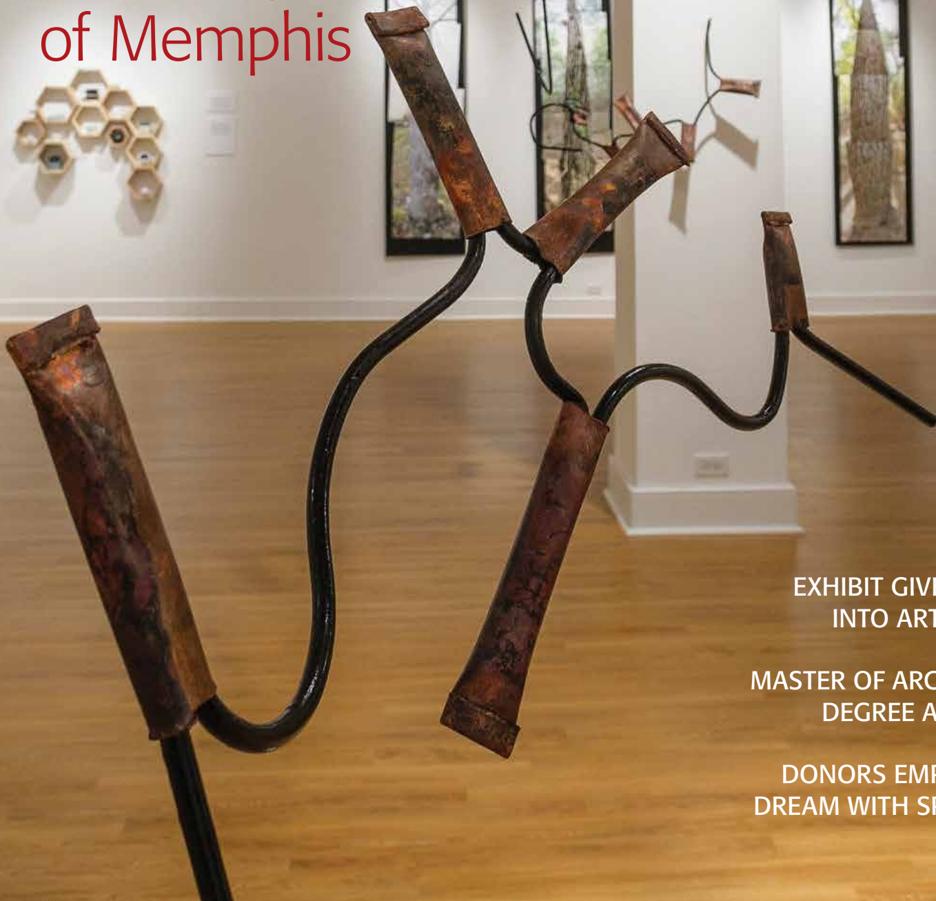
EXHIBIT GIVES GLIMPSE INTO ARTIST'S MIND

New Galleries Open at the University of Memphis