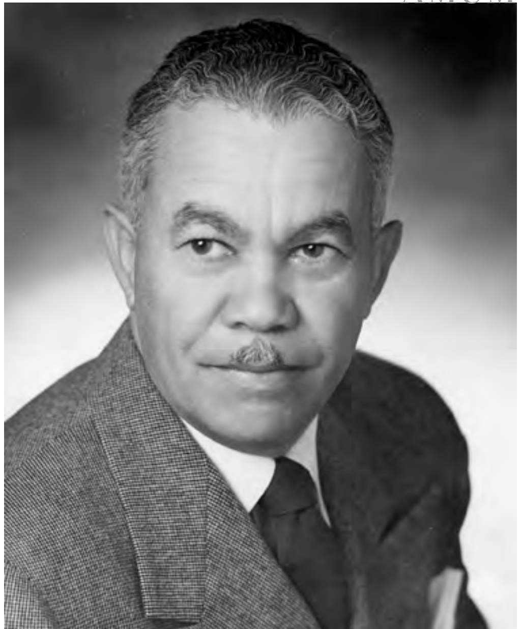
Paul R. Williams, 1951