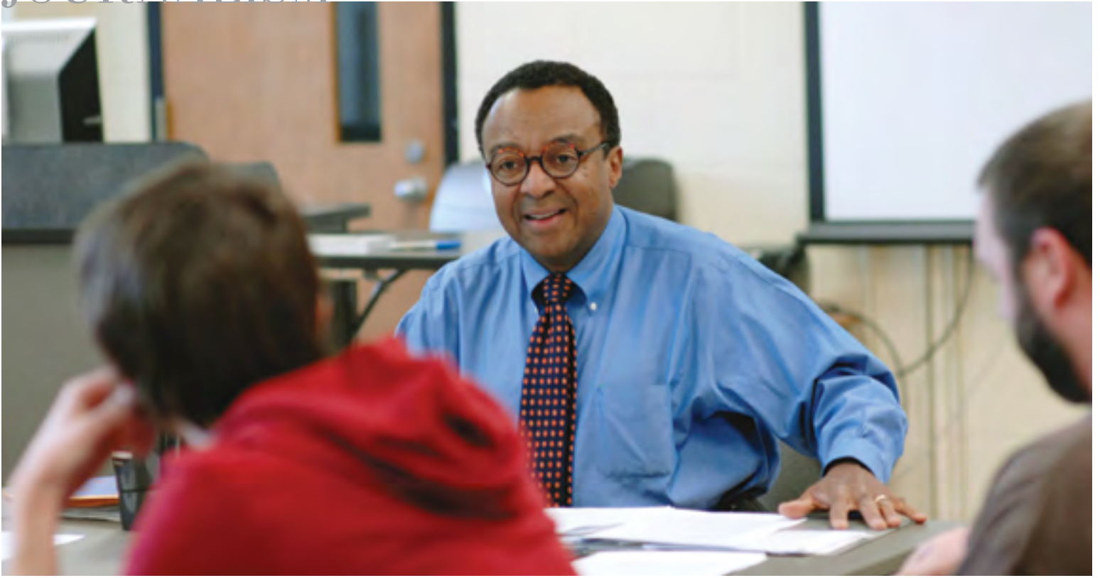
Clarence Page (center) talking with U of M journalism students.