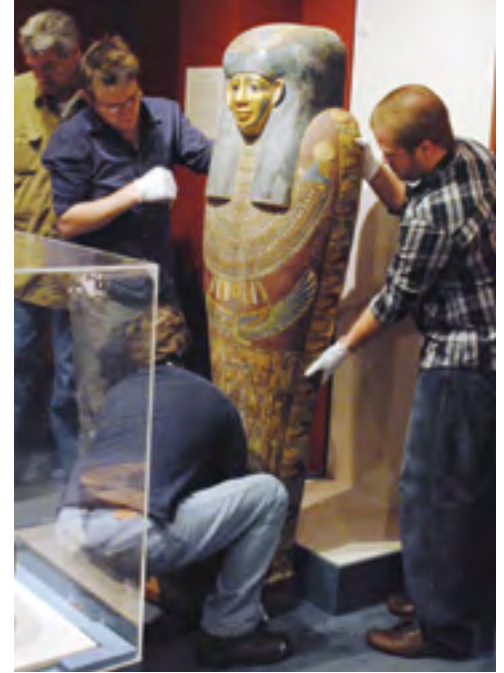
Left: Irtw-irw, his coffin base and his mask are now enclosed by an environmentally secure exhibition case. Right: The coffin lid of Irtw-irw is moved into its new display area.