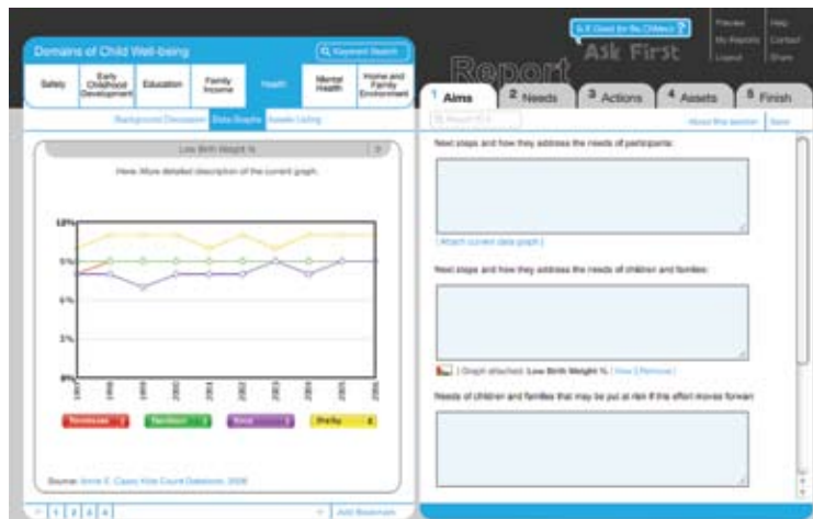
The user interface of the Child Impact Statement Reporting System, developed by the Center For Multimedia Arts.