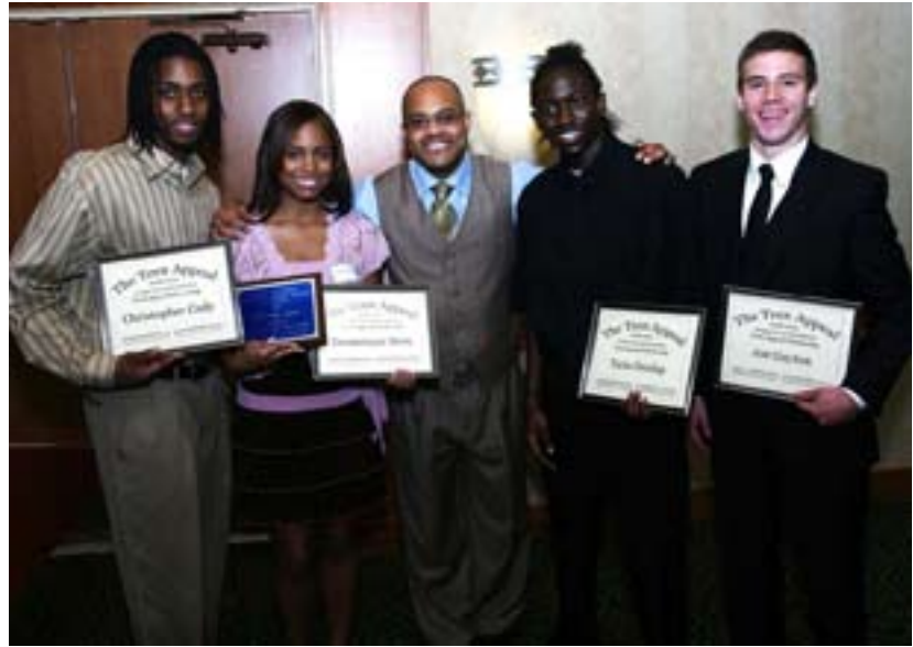
The Teen Appeal scholarship class