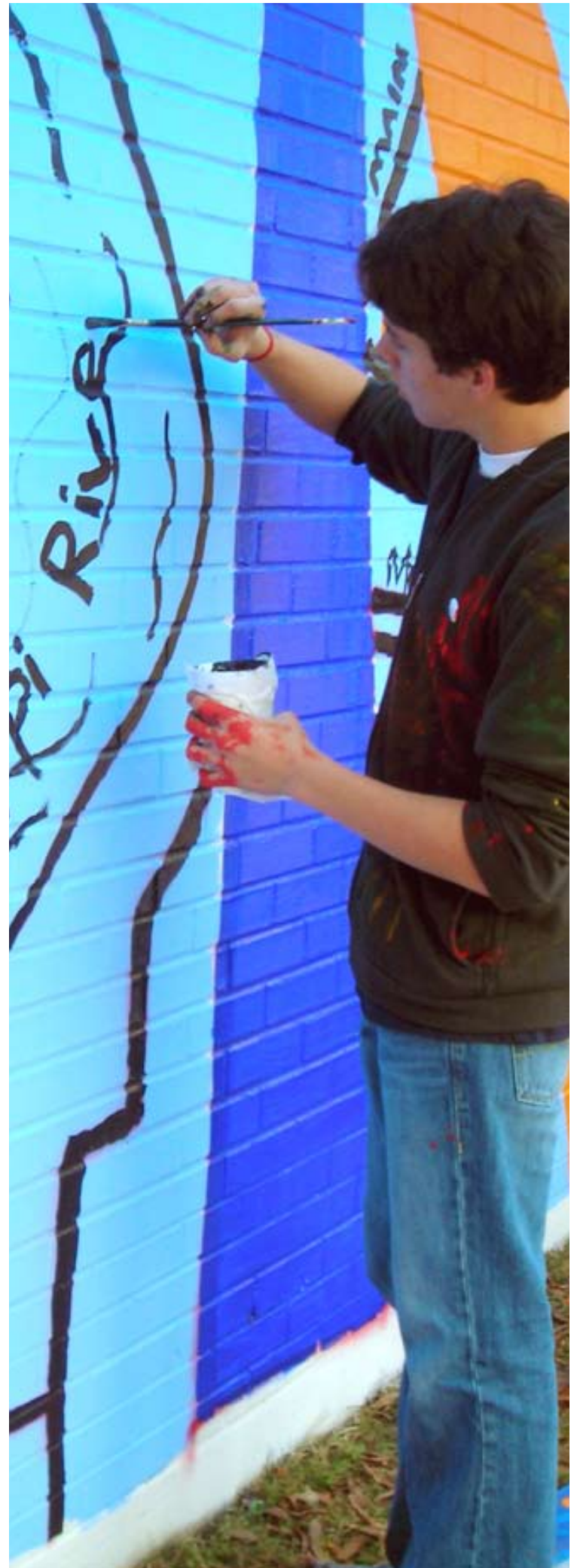
Art Academy students and PeaceJam participants help paint the “Hope Mural” at Davis Community Center in February.

An art exhibition of the work of Art Academy participants at the Davis Center was the culminating event of the Academy’s inaugural semester. The Academy will continue as a once a week after school program during fall 2009 semester.