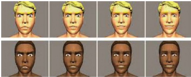
FIGURE 1. SAMPLE FACIAL EXPRESSION TEST

This behavior ranges from perceiving facial expressions differently to offering job callbacks at different rates to seeing guns more quickly in relation to some racial groups relative to others. Specifically, in studies of facial expressions, whites with stronger implicit racial bias perceive black faces as angrier than whites with weaker levels of bias; similarly, those with stronger implicit bias are apt to consider an expression happy or neutral if displayed by a white person, but neutral or angry if displayed by a black person (Hugenberg & Bodenhausen, 2003).