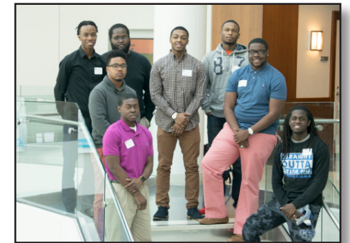
HAAMI members at monthly session.

HAAMI is successful in large part because of the commitment of the HAAMI members to positively shape a future that includes their personal and professional success. Additionally, the Hooks Institute is proud of the collaborations that make HAAMI possible: committed students, community members, businesses, and the staff of the Hooks Institute. Together we can build a strong Memphis and nation by investing in African-American male success!