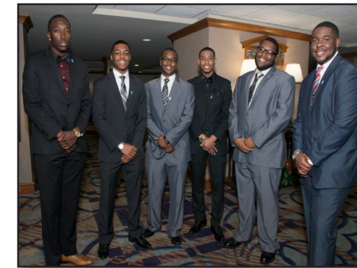
HAAMI members celebrate a successful year at the 2017 Hooks Gala, April 20, 2017.

HARNESSING THE POWER OF TALENT: AFRICAN-AMERICAN MALE STUDENTS